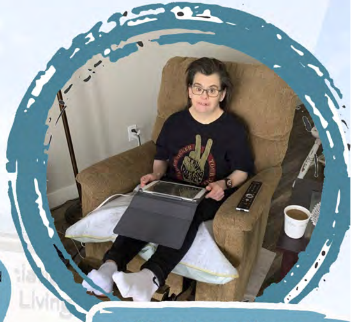
Individuals learned to use technology and found creative ways to connect virtually.

Development of online training kept employees growing and learning during lockdowns.