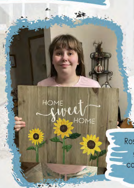
Rose Club offered an abundance of great activities to keep people connected and having fun despite not being able to gather!

Virtual Community Kitchen cooking got more participants than ever!