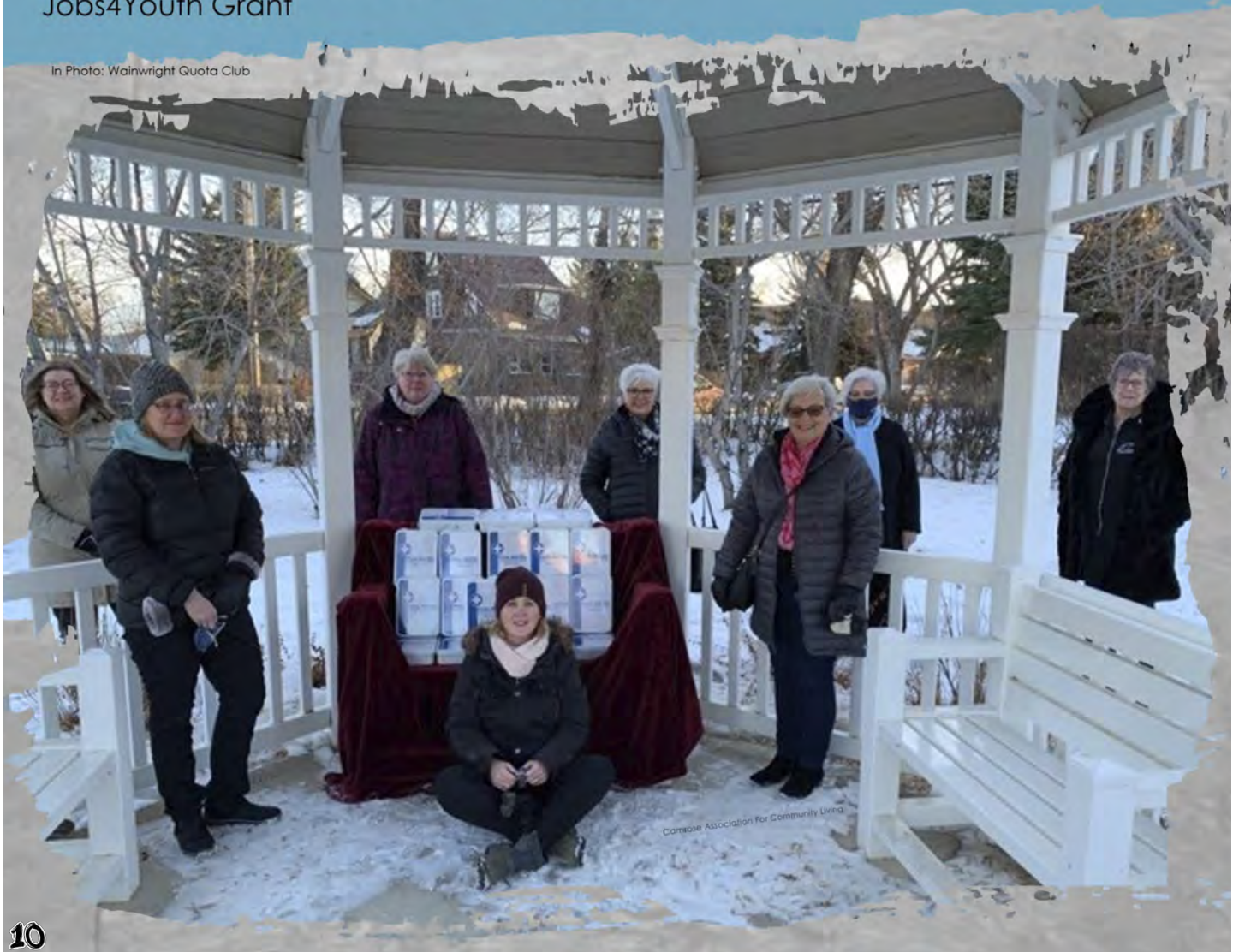
Camrose Association For Community Living