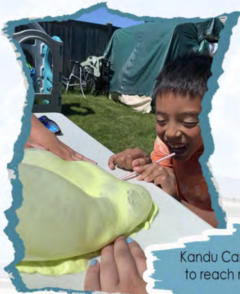
Kandu Camp took to the road to reach rural families feeling isolated.

The COVID- pandemic didn't stop CAFCL - we had a great year full of new challenges and learning!